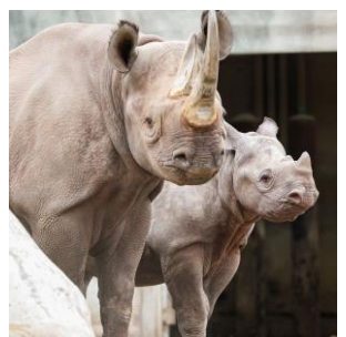
The May 26 LAFCU Listen & Learn will feature otters and rhinos from Lansing's Potter Park Zoo, including Jaali, a rare black rhino calf that is heading to a new home this fall.